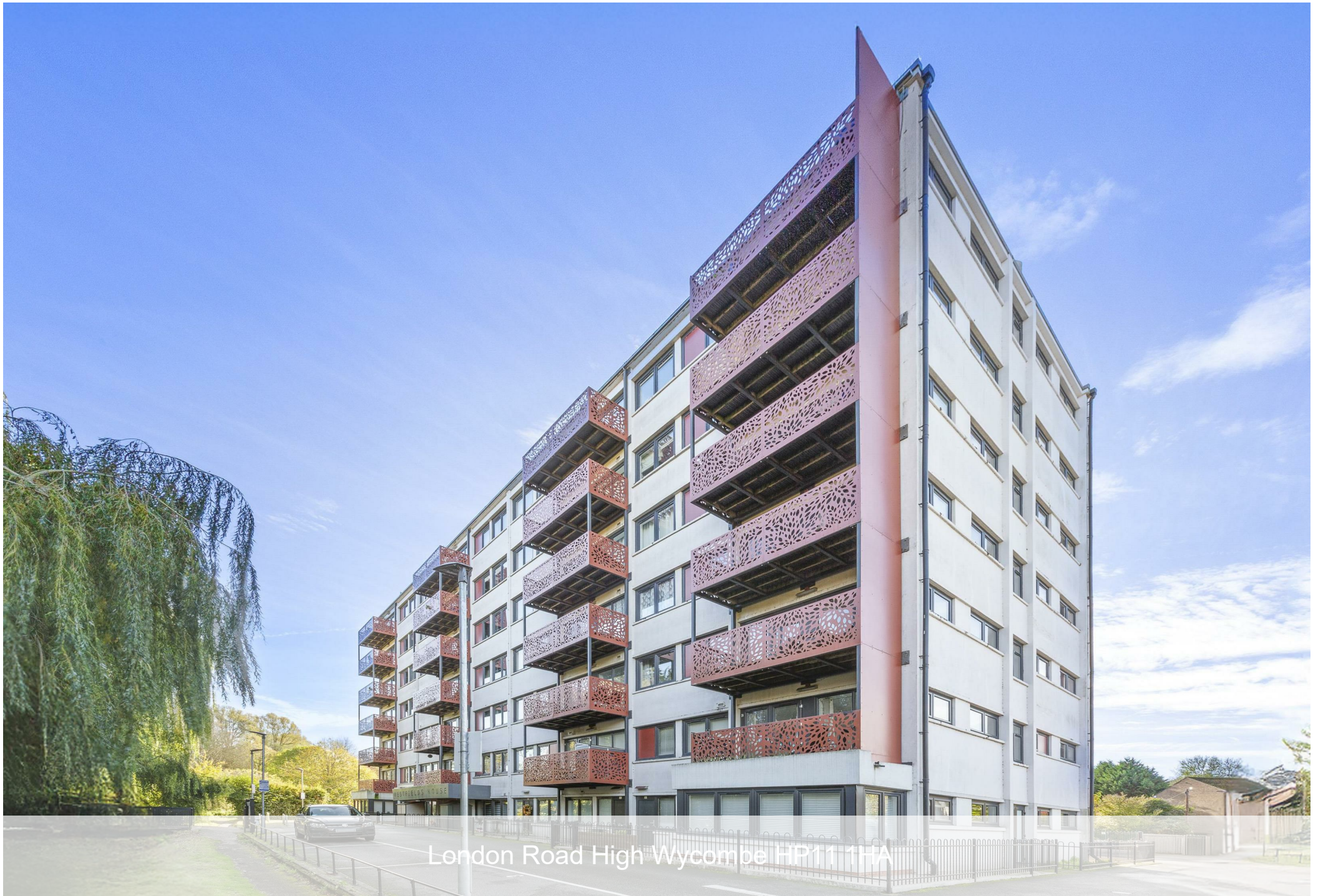
London Road High Wycombe HP11 1HA